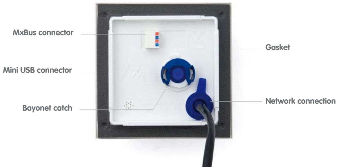
(T25 – Camera housing and connectors, excerpt from the technical documentation)