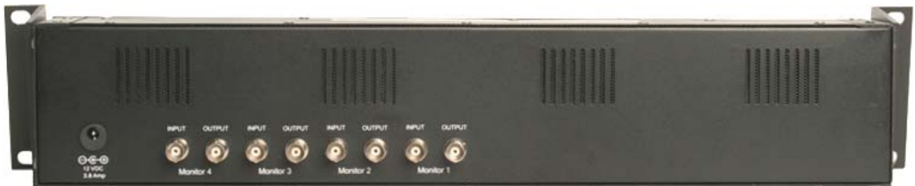
Figure 3: Back Panel of PreVIEW Quad 4 showing 2-BNC connectors (in & out) per LCD and power connector.