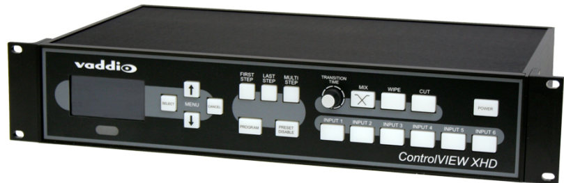
Figure 1: ControlVIEW XHD Camera Control System

Vaddio introduces the ControlVIEW XHD, a multi-input PTZ camera control system designed for a variety of presenter-controlled applications in conjunction with our preset camera trigger devices such as StepVIEW mats, AutoVIEW IR sensors, MicVIEW and TouchVIEW. In addition, the ControlVIEW XHD can be a stand-alone video switcher or used with our Precision Camera Controller.