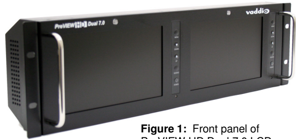
Figure 1: Front panel of PreVIEW HD Dual 7.0 LCD

Vaddio's PreVIEW HD line of monitors are excellent for a variety of applications that require high resolution monitoring of HD cameras, including houses of worship, training rooms and board rooms at corporate facilities, as well as instructional facilities at teaching hospitals.