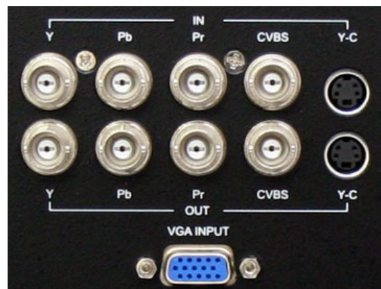
Figure 3: (right) Close up of rear panel inputs showing 8 BNC connectors (in & out) for HD component (Y Pb Pr) and composite video per LCD screen, along with S-Video connectors for Y-C video and a VGA input connector. All loop-thru connectors are active and auto-terminating.