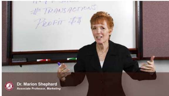
Figures 8, 9, 10 & 11: Simulated pictures of Lower Screen Graphics feature.