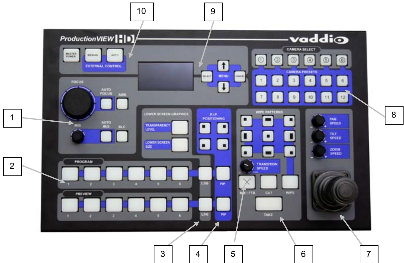
Figure 2: ProductionVIEW HD with key features highlighted