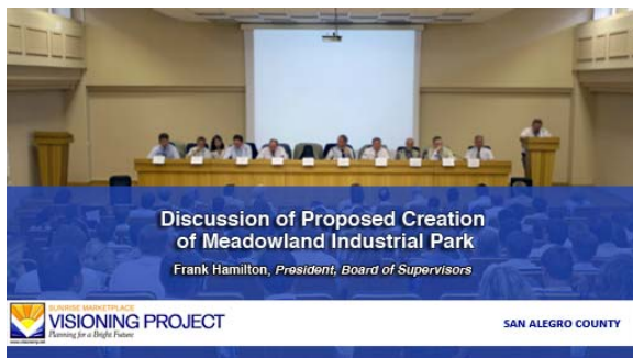
Lower Screen Graphic covering one-half of the screen, with a transparency level of 75%