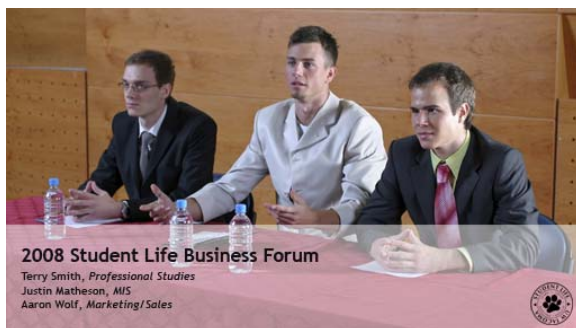
Lower Screen Graphic covering one-third of the screen, with a transparency level of 50%