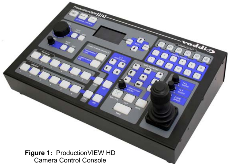
Figure 1: ProductionVIEW HD Camera Control Console

In our relentless drive to redefine camera control, Vaddio introduces the ProductionVIEW HD multi-camera control system. Designed to handle the most demanding live broadcast or staging events, it's still simple enough to allow a novice to shoot like a pro. ProductionVIEW HD integrates PTZ camera control and multi-format HD/SD live switching with real-time graphics and effects into one easy-to-use control console.