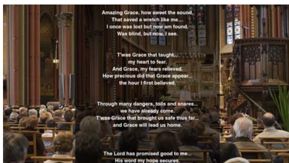
Lower Screen Graphic covering the entire screen, with a transparency level of 50%