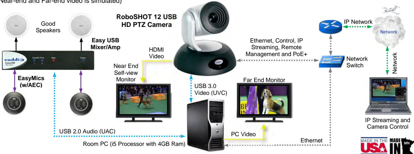
RoboSHOT 12 USB, EasyUSB™ Mixer/Amp, EasyMics, UC Conferencing Application, Monitors and Speakers (Near-end and Far-end video is simulated)