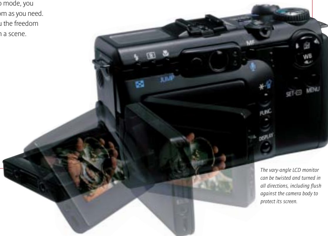
The vary-angle LCD monitor can be twisted and turned in all directions, including flush against the camera body to protect its screen.

When you hold a PowerShot G5 you will soon discover that five is a handy number to have.