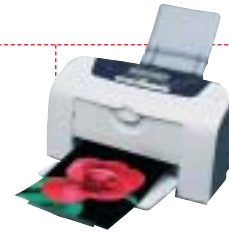
Bubble Jet Direct Photo Printers • BJ i470D • BJ i450 • BJ i70