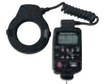
Macro Ring Lite MR-14EX