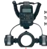
Macro Twin Lite MT-24EX