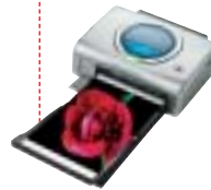
Card Photo Printers • CP-300 • CP-200