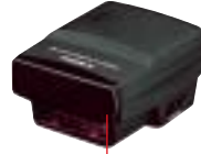
Speedlite Transmitter ST-E2