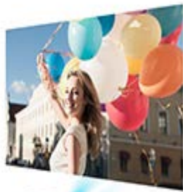
Conventional projectors offer low-quality images