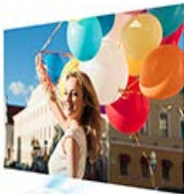
SuperColor™ projectors offer color accuracy levels