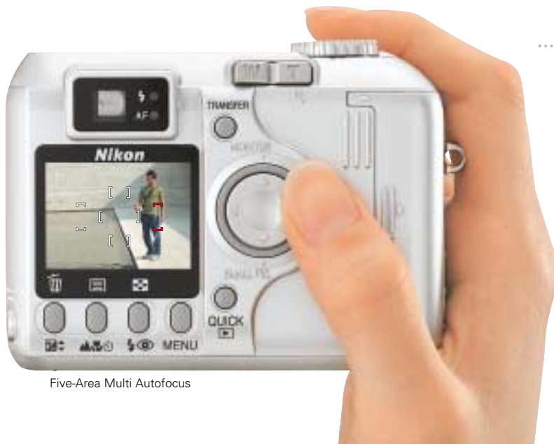
Five-Area Multi Autofocus

The intelligent built-in Speedlight fires automatically when ambient light is insufficient, or when shooting a backlit subject. Select from Auto Flash, Flash Cancel, Anytime Flash, Slow Sync and Red-Eye Reduction modes, and enjoy bright, colourful pictures anytime.