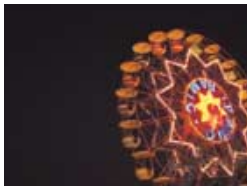
With Noise Reduction