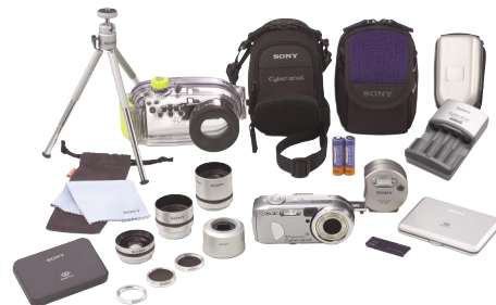
CAMERA WITH OPTIONAL ACCESSORIES

ACC-CN3P/ACC-CN3M Starter Kit NH-AA-2DA Rechargeable NiMH Batteries (2pk) VAD-PEB Conversion Lens Adaptor Mount VCL-DH0730 Wide Angle Conversion Lens* VCL-DH2630 Super Telephoto Conversion Lens* VCL-DH1730 Telephoto Conversion Lens* VF-30CPKS Polarizing Kit Filter* HVL-FSL1B External Slave Flash w/ Bracket MPK-PEA Marine Pack LCM-PEA "Just Fit" Carrying Case LCS-CSD General Carrying Case LCH-MA Memory Stick® Media Carrying Case MSA-32A, MSA-64A, MSA-128A Memory Stick® Media MSA-128S2 Memory Stick® Media with Select Function (256MB total) MSA-256, MSX-512, MSX-1G Memory Stick PRO™ Media MSAC-US30 Memory Stick PRO™ Media USB Adaptor * VAD-PEB Conversion Lens Adaptor Mount Required