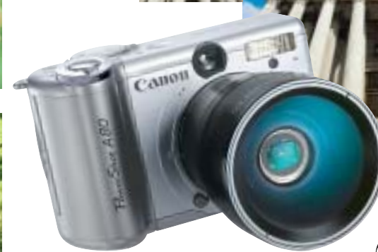
With wide converter WC-DC52*