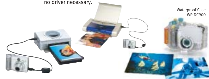
Waterproof Case WP-DC900

Adjust your viewing angle over a wide range with the Vari-Angle LCD monitor.