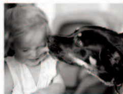
Black and White

Customizing PowerShot to match your picture-taking preferences is a breeze. With Sound Memo capability up to 60 seconds and the ability to input favorite start-up, and sound preferences, you're ready to shoot without missing a beat.