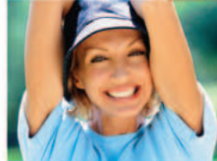
5x Digital Zoom

Thanks to five focusing sensors that instantly analyze every shooting variable, even if your subject is far from center, you can count on great images... just the way you see them.