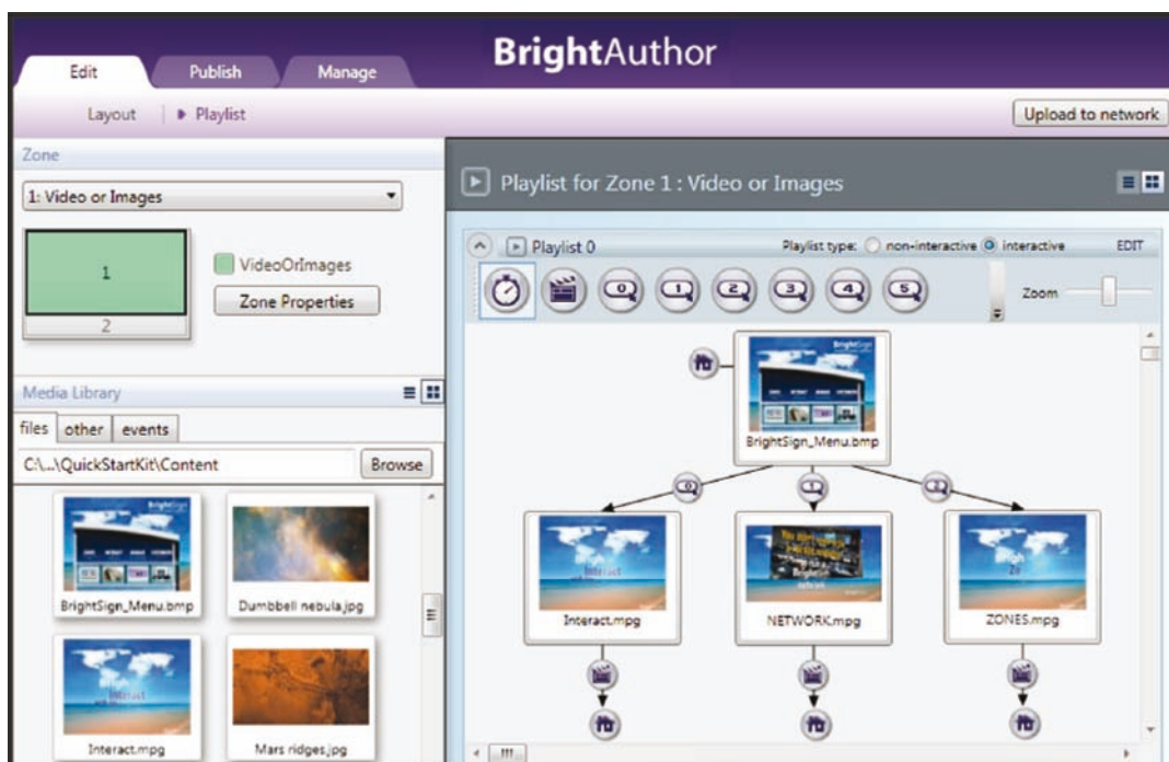
Interactive playlist using buttons